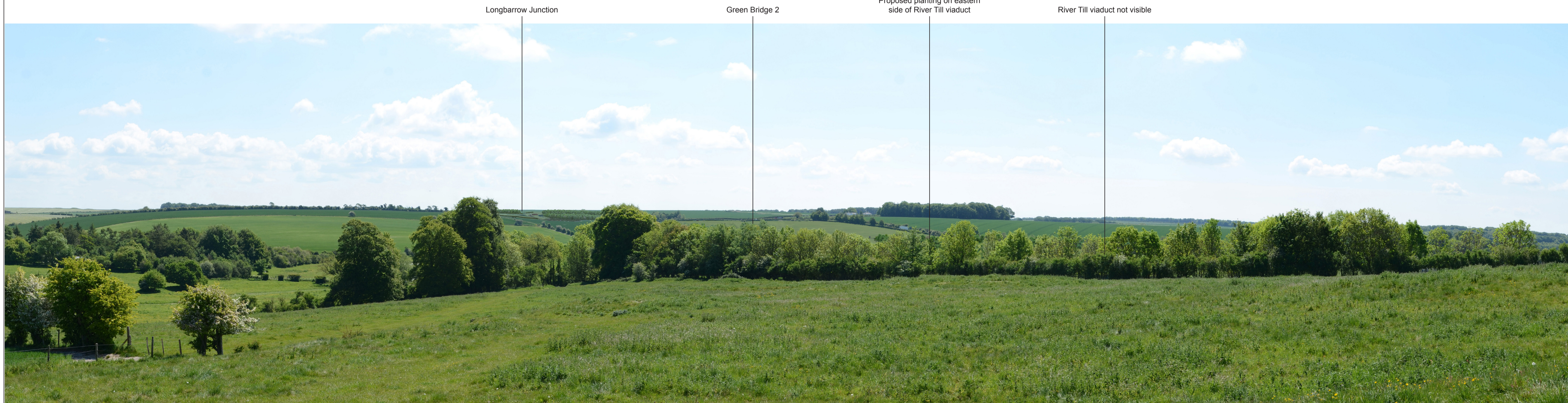
PROPOSED (SUMMER YEAR 15)